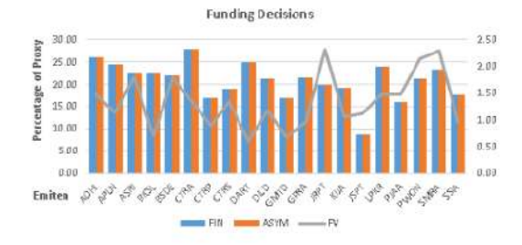
Fig. 1. Funding decisions affect asymmetric information and firm Value

The Figure above is able to explain the results of the study that the higher the company is financed from debt, it will increase and expand the emergence of asymmetric information, which in turn will reduce the value of the company.